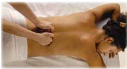
Massage Therapy: By Appointment Only: 953-8144